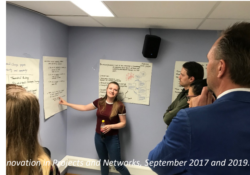
Photos from NORSI and BI courses Innovation in Projects and Networks , September 2017 and 2019.