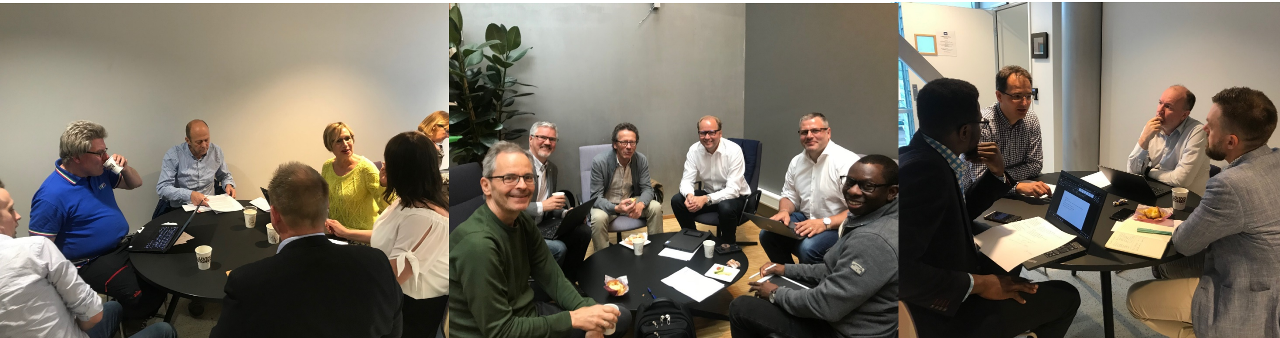
Photos from Nordic NORSI Workshop June 2019